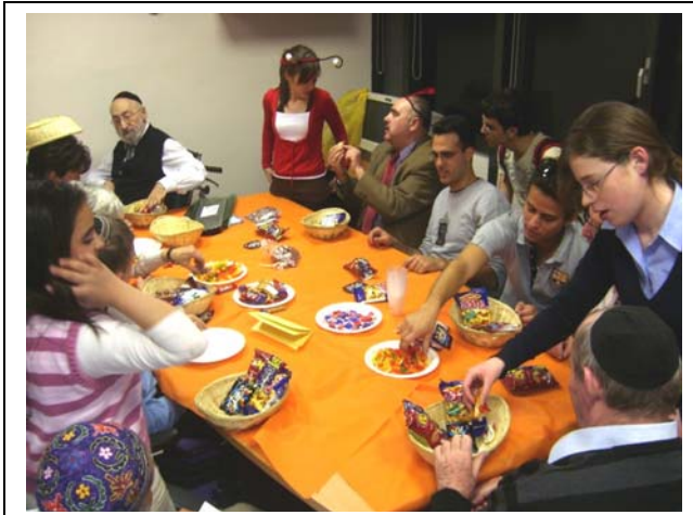
Members of the Adler Aphasia Center at Hadassah College celebrate Purim with family and friends.